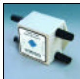
TWT-CSE-0227 for copper pipes only 2" or less in diameter The copper signal enhancer is a passive signal / impedance matching circuit. This device provides a power boost to the conditioning signal in copper pipes.