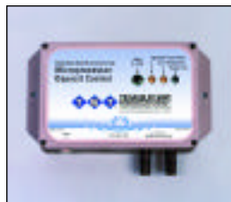
TWT-5C8-472 Residential Commercial Deposit Control System For Pipes 1 inch or less in diameter—9 vdc transformer